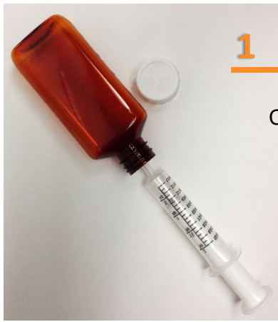
1 ORAL SYRINGE Clear - Graduated 10 ml / 2 tsp