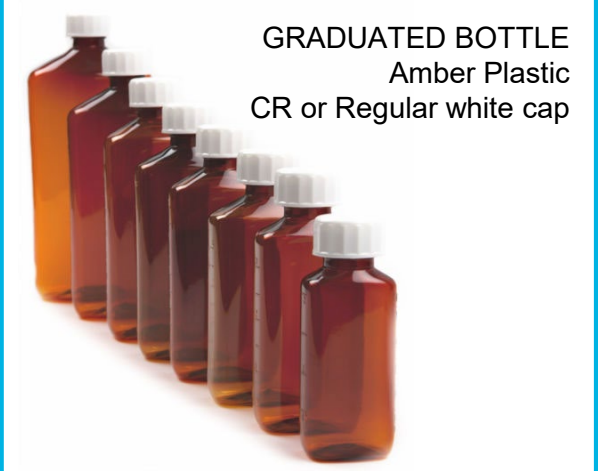
GRADUATED BOTTLE Amber Plastic CR or Regular white cap

Capacity: 60 • 100 • 125 • 150 • 175 • 250 • 350 • 500 ml